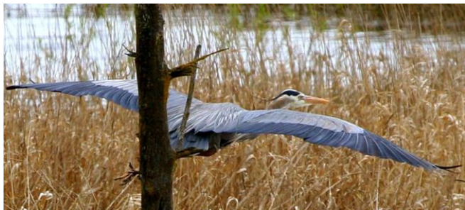
Figure 3. Water quality trading can achieve regulatory compliance while providing cobenefits such as habitat for birds and other wildlife

Willamette Partnership will also work with the agencies and The Freshwater Trust to consider input from producers, utilities, environmental groups, and others.