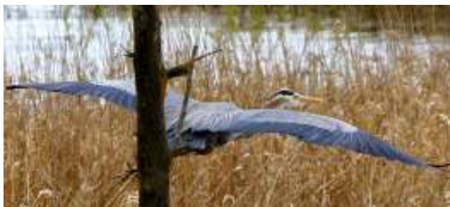
Figure 3. Water quality trading can achieve regulatory compliance while providing cobenefits such as habitat for birds and other wildlife

Willamette Partnership will also work with the agencies and The Freshwater Trust to consider input from producers, utilities, environmental groups, and others.