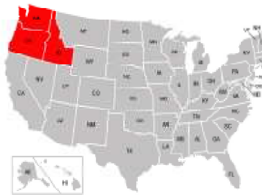
Figure 1. Oregon, Washington and Idaho water quality agencies and US EPA are direct participants in the Joint Regional Agreement process.

Idaho, Oregon and Washington water quality agencies, and US EPA Region 10 are now leading the way in driving consistency among state water quality trading programs by engaging in development of a Joint Regional Agreement that will define a common framework under which trades should occur and a common set of procedures, standards and guidelines to govern trading. The state agencies, in collaboration with US EPA, will lead most of the components of this project, with Willamette Partnership providing support in coordination, facilitation and document management, and The Freshwater Trust advising and providing process support.